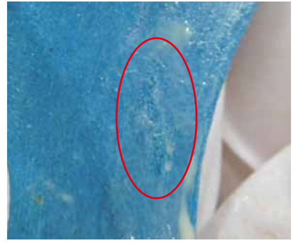
Figure 4 Compression-fracture test of improved seal paste Compression fracture was confirmed at 100 MPa.

gaskets which suffered compression fracture.