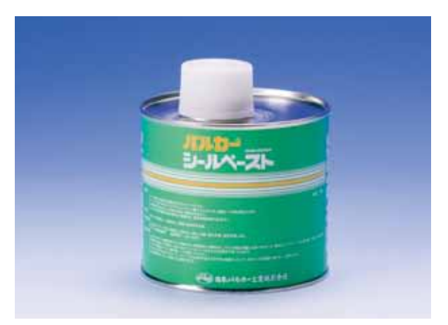
Figure 1 Improved seal paste

The improved seal paste is a light brown paste based on a special, non-drying, oil-based bond formulated with inorganic filler and a small amount of solvent. The formulation is an improvement over the conventional seal paste, as it contains no carcinogenic substances. In addition, it is categorized as a nonhazardous material under the Fire Service Act. Thus, the product is safer and more environment-friendly.