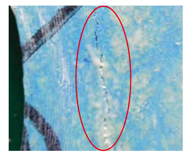
Figure 3 Compression-fracture test of conventional seal paste Compression fracture was confirmed at 100 MPa.

No abnormalities occurred at contact pressures of up to 70 MPa, neither with the improved seal paste nor with the conventional seal paste. Compression fracture occurred at a contact pressure of 100 MPa with both pastes, verifying that the two pastes have equivalent properties. Figures 3 and 4 show enlarged photos of